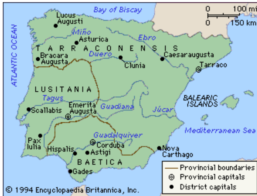
1. Hispania in Augustus time. From Encyclopaedia Britannica.

Look at the map and answer the following questions.