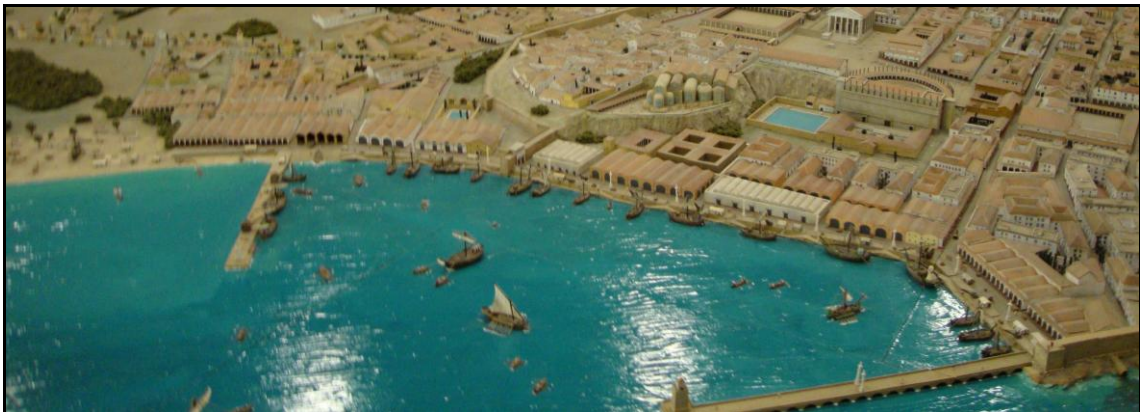
2. Tarraco's harbour (model).