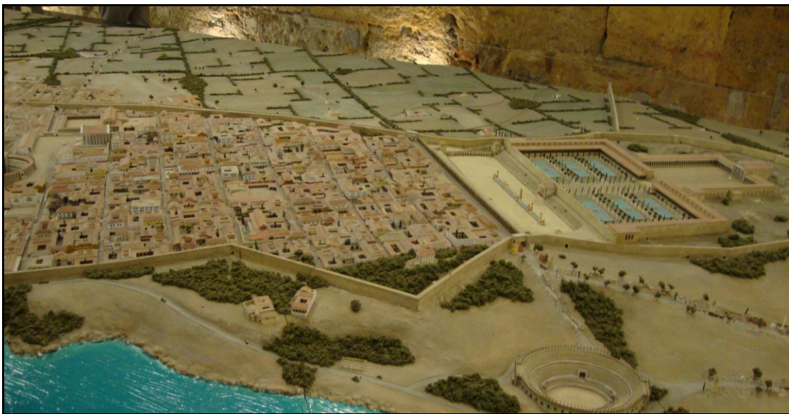
3. Tarraco's walls, amphitheatre, Circus, forum and theatre. See the aqueduct on the top right.

The residential area of Tarraco was made up of domi (houses) and insulae (apartment blocks).